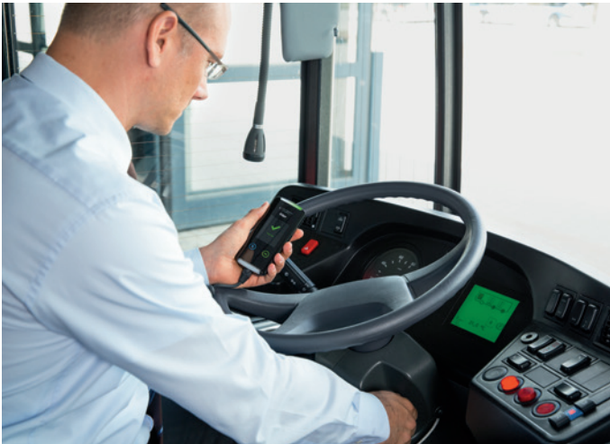
A measure against alcohol misuse are devices directly installed in a vehicle: Before you start the engine, they measure the alcohol content in your breath. When no alcohol is detected you can drive.